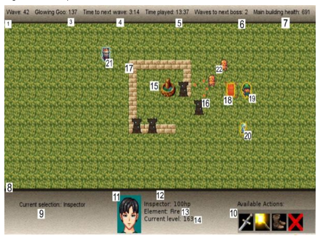
Example screen for a running game